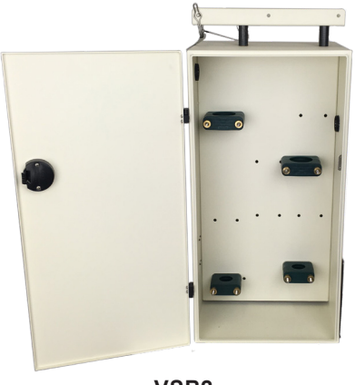
VSB<sub>2</sub> (shown open with internal clamps)