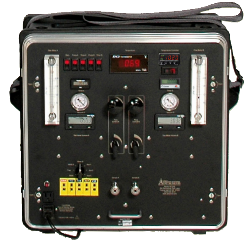
XC-260 Manual Source Sampler Console Sampler also Ideal for Method 18.